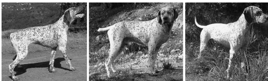
Figure 1. Illustration of Bourbonnais Pointer dogs showing a tailless (anury) phenotype on the left, a short-tail (brachyury) phenotype in the middle, and a long-tail phenotype on the right.

comparison, another likely recessively inherited type of bobtail exists in Bulldogs where all dogs in the breed have short tails with multiple kinks (Whitney 1947). There are also occasional reports of short-tailed dogs born from long-tailed parents in some breeds, revealing multiple patterns of inheritance or variations in penetrance.